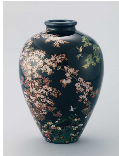
Namikawa Yasuyuki 《Vase with Design of Birds and Flowers of the Four Seasons》 [Full]