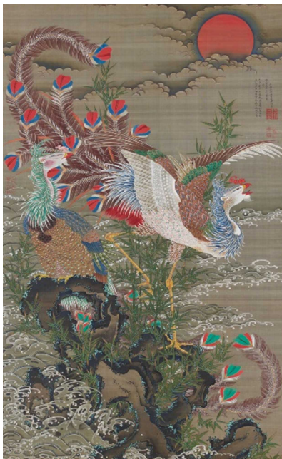
Itō Jakuchū 《Phoenixes and the Rising Sun》 [Second]