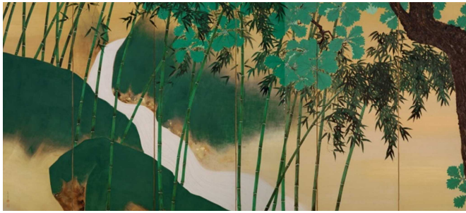
Hirafuku Hyakusui 《Oak Trees》 [First]