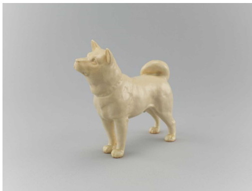
《Akita Dog》 [Full]