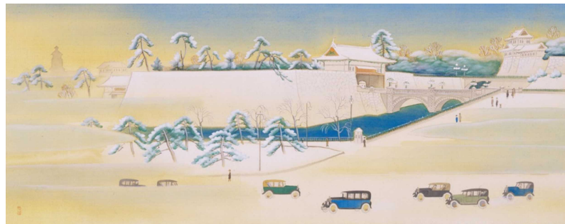
Matsuoka Eikyū and 11 other artists 《Scroll of Contemporary Genre Scenes》 [Second]