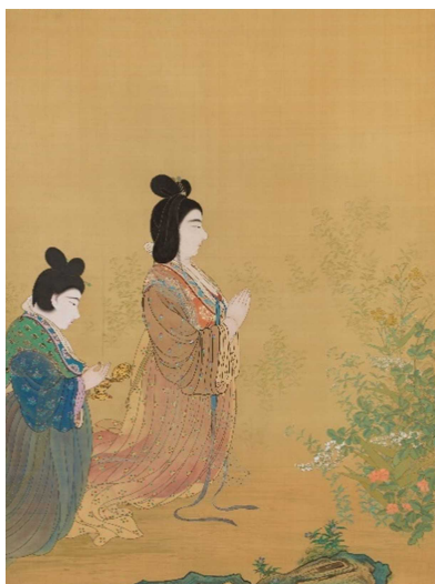
Shimomura Kanzan 《Empress Komyo》 [Second]