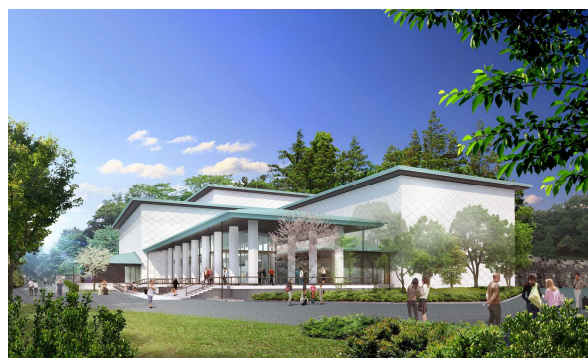
Image of opening in 2028

Sannomaru Shōzōkan has organized more than 100 special exhibitions based on research of the museum's curators, and carried out various restoration projects to ensure the stable transmission of its works to future generations. As the numbers of works in the collection has increased, and the scope of the museum's activities has expanded, the current building has become too small, and a new expanded facility is under construction on an adjacent site, which will open in Autumn this year. The museum will continue to pass on the valuable items inherited from the Imperial Family to the next generation, and continue to enhance its activities as a base for introducing the Imperial Family and Japanese culture to the world.