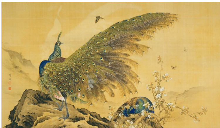
Araki Kampo 《Peacocks》 [First]