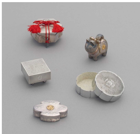
《Bonbonniere》 (out of 10) [Full]